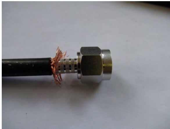
Slide connector on