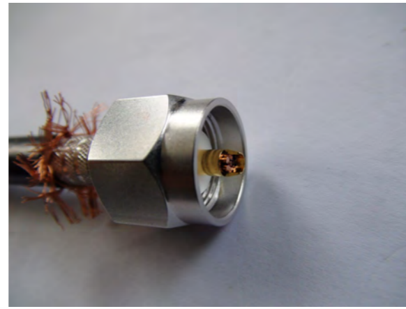
Ensure conductor is correct