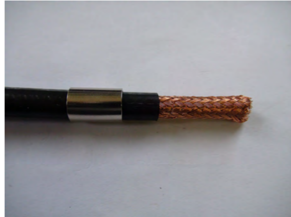
Slide on crimp sleeve