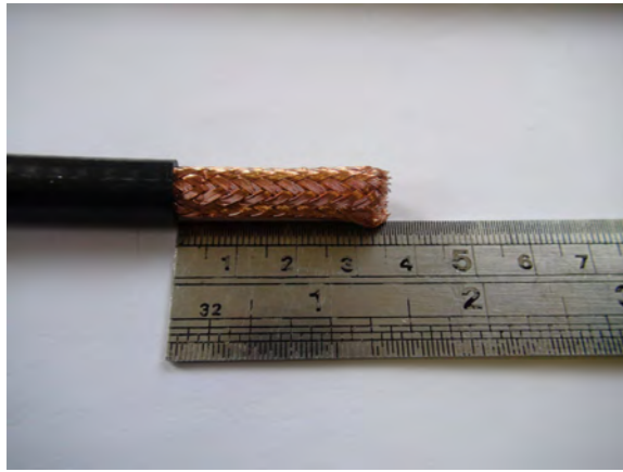
Trim Jacket back 35 mm