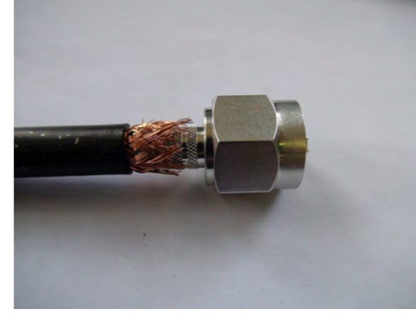
Fold braid over body