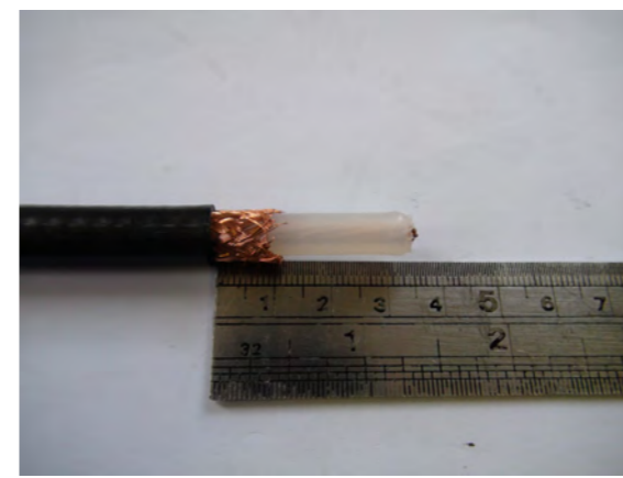
Trim braid to 10 mm long